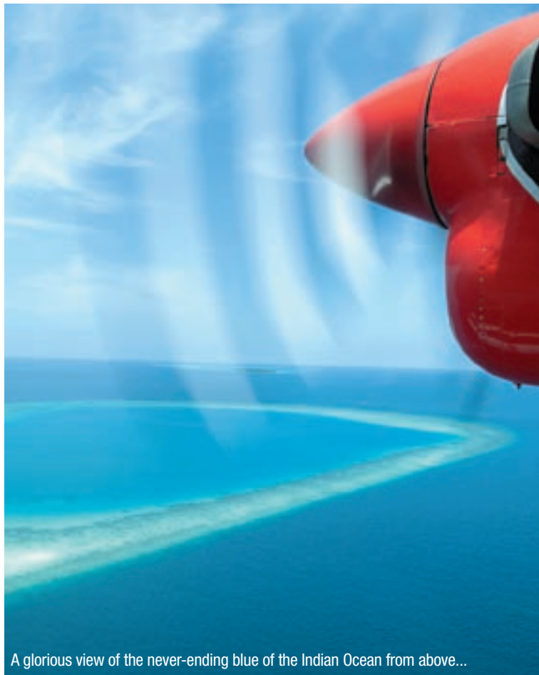
A glorious view of the never-ending blue of the Indian Ocean from above...