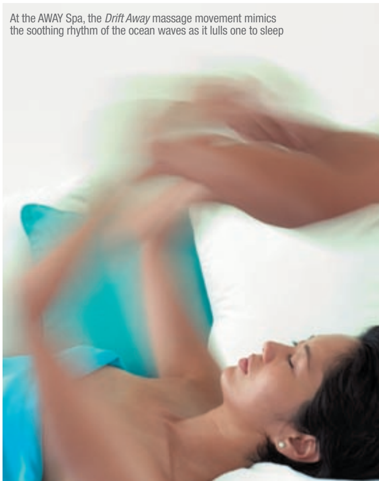
At the AWAY Spa, the Drift Away massage movement mimics the soothing rhythm of the ocean waves as it lulls one to sleep