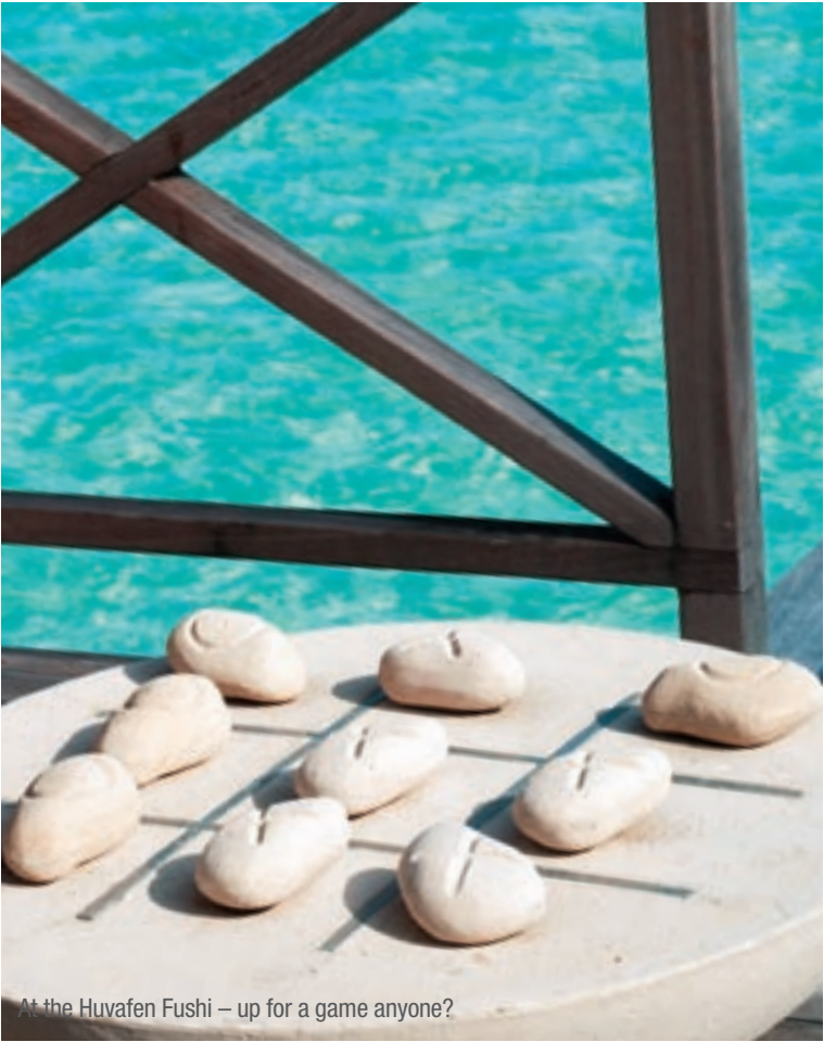
At the Huvafen Fushi – up for a game anyone?