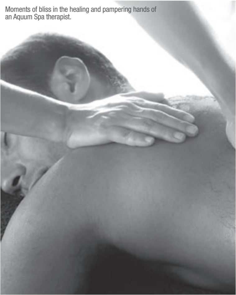
Moments of bliss in the healing and pampering hands of an Aquum Spa therapist.