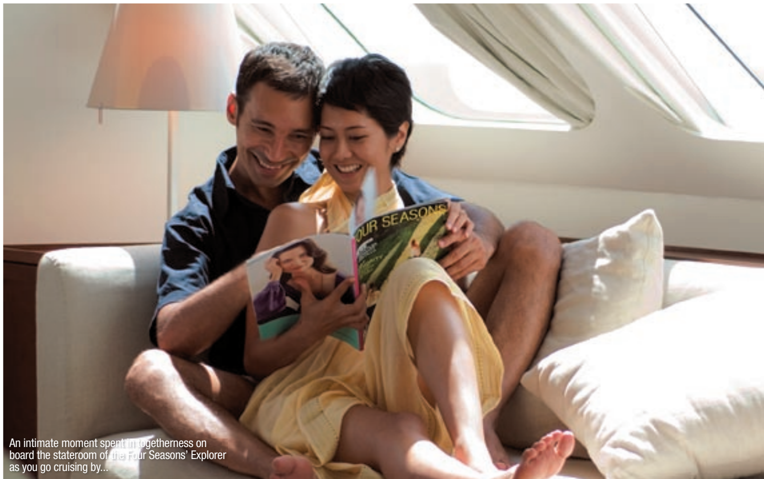
An intimate moment spent in togetherness on board the stateroom of the Four Seasons' Explorer as you go cruising by...

their feet into heavenly bliss! For the finale, a “share pleasure dining” at the floating platform comes with stunning view to complete the journey of sensual delight. Recommended for the perfect moment to make memorable memories!