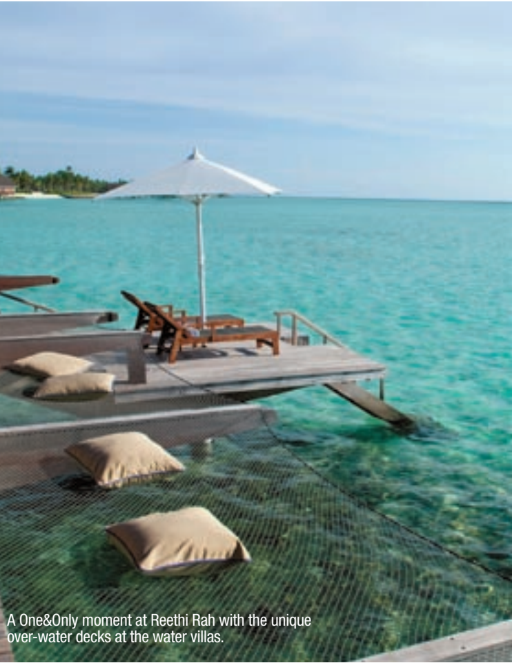
A One&Only moment at Reethi Rah with the unique over-water decks at the water villas.